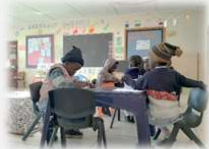
Concentrating on writing the letter 'e' in their workbook