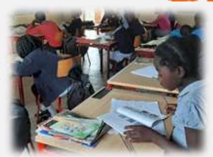
Developing confidence and independence

We have continued to be impressed by this class and their mature attitude towards learning. Although at times the work seems too difficult or they would rather be outside playing they have put in the effort with reading, note taking and answering questions to show that they do belong in the upper section of the school. We have definitely noticed an improvement with their confidence in spoken English and discipline to do what is asked of them. This class are very familiar with their reading routines and love sharing books with others. We hope that these good learning habits continue to grow and enable them to see the wealth of opportunities that now lie ahead.