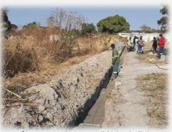
Our new perimeter wall being built in the August holiday

We are always looking for ways to develop Kapumpe, both academically and physically. This year it became more apparent that we needed to replace our security fence with a brick wall. Having raised most of the money, we decided to begin building the wall in the August holiday. As our land is on a slight incline it makes getting the height of the wall a little tricky but the builders are doing a good job. It seems very strange to come on site and not see the neighbours the other side now. We plan to paint the wall white so the space still feels very light. When there have been fires in the next door fields, we have been running up and down with hoses to protect our property. Once the wall is built this will keep the fires at bay for us. Hopefully it will also help pupils to be more focused, prevent balls from going astray, stop chickens from eating our vegetables and help everyone to feel safer when on the Arise Kapumpe site.