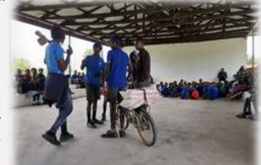
A lot of thought, rehearsals and props go into the G7 assemblies