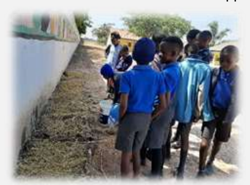
Watering our vegetables the traditional way