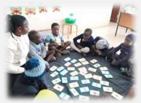
Playing a game of 'say the sound' with new shiny cards