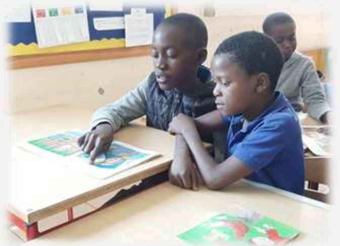
Reading buddies is a highlight of the week for the pupils

You may remember from our previous newsletter that we were having a focus on reading this term at Kapumpe. One of the initiatives we launched was, 'Reading Buddies'. This is where pupils are paired with a partner from a different grade for reading. At a specific time the whole school picks up their books and moves to the right room and space to sit with their reading buddy. One reads first with the partner supporting and listening then half way through the time they swap roles. The staff were a little apprehensive at first how this might work logistically but after careful planning with clear instructions, it has been managed very smoothly. The pupils have loved going to read with a buddy (rather than a teacher). Weaker readers have become more confident and will attempt difficult words and the more able readers have developed their expression and comprehension now that they are reading to an audience and explaining the story. Due to the huge success it has been, we are keeping this activity in our timetable.